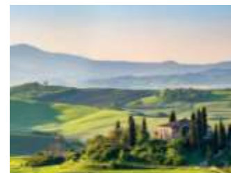
Programma Rete Rurale Nazionale 2014-2020 Piano Biennale 2017-18