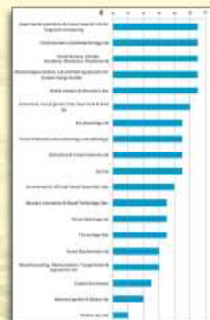
Frequency graph of the infrastructures belonging to the forest research institutes of the FORESTERRA countries. Bajocco et al., 2015.